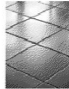
Tile & Stone

Flooded? Emergency Water Damage Service Available