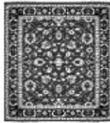
Oriental Rugs Cleaned in Your Home