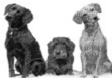
Pet Urine Specializing in Pet Odor Removal

Trust your local Chem-Dry professional for all these services